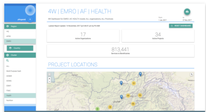
Cluster 4W Dashboard