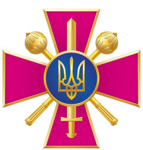
Ministry of Defense