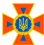
State Emergency Service